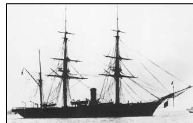
French steam corvette Duplex 1856-1887

Trivia Question: We will not have a question this month since I will be in Eureka Spring for Corvette weekend.