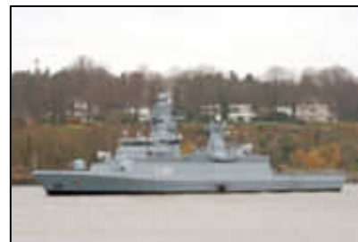
Corvette Braunschweig of the German Navy